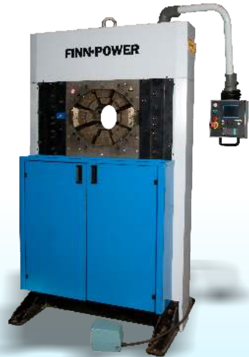
State of art Manufacturing